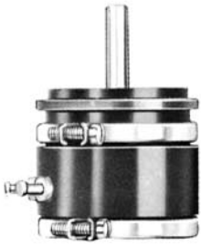
SERVO MOUNT/BALL BEARING MODEL 1721