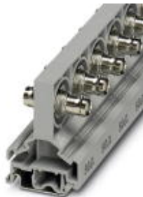
BNC connector, single-level, for mounting on NS 32 or NS 35/7.5, wave impedance: 50 Ohm

Please be informed that the data shown in this PDF Document is generated from our Online Catalog. Please find the complete data in the user's documentation. Our General Terms of Use for Downloads are valid ( http://phoenixcontact.com/download )