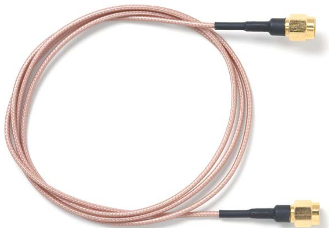
Model 4846-UU SMA Plug to SMA Plug, RG178B/U

Small size, and durability for confident connections