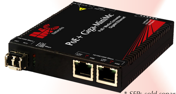
* SFPs sold separately

The PoE and PoE+Giga-MiniMc are low-cost, compact, multi-port media converters that support both PoE and PoE+ standards. Utilizing their flexibility and compact size, interior private network applications can further benefit from the ever-expanding versatility of the MiniMc product line.