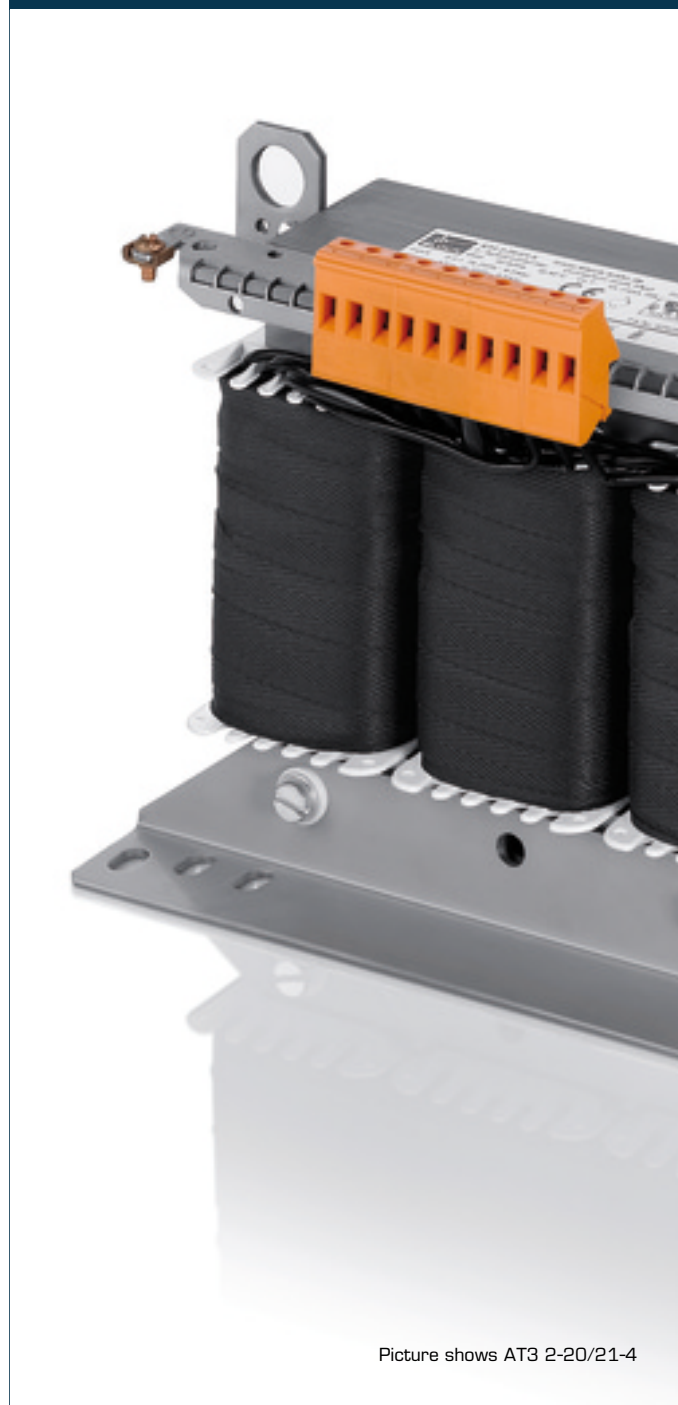
Picture shows AT3 2-20/21-4