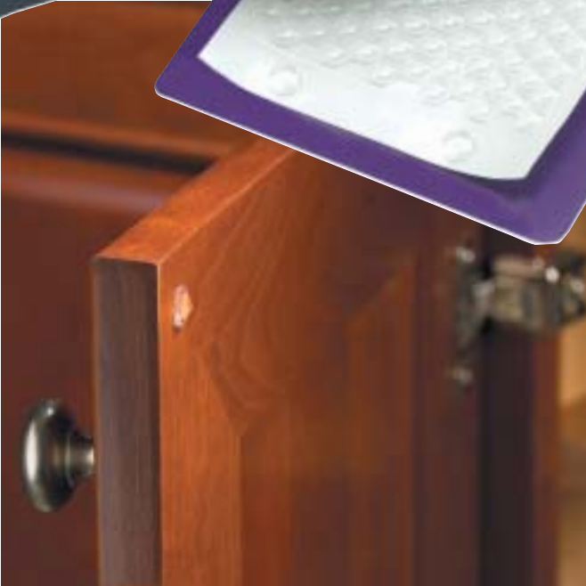
From doors to drawers and vents