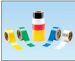
Printable Floor Tape