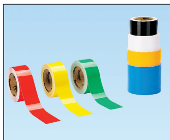
Solid Color Floor Tape