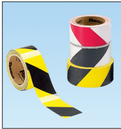
Striped Floor Tape