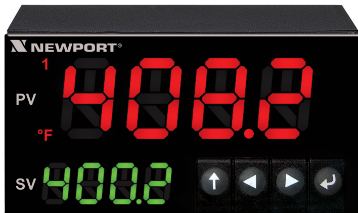
Pt8D Series shown actual size.