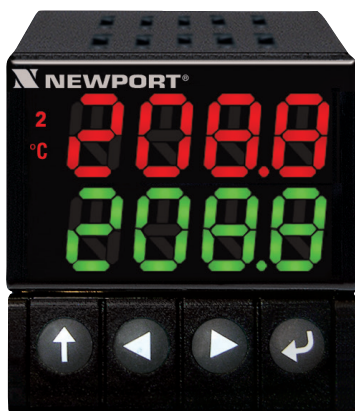
Pt16D Series shown actual size.

Industry Leading Performance...and Easy to Use