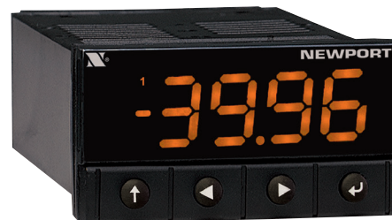
Pt32 Series shown actual size.