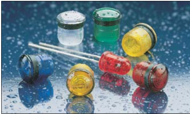
U.S. & Foreign Patents Issued and Pending