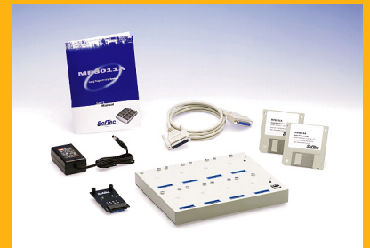
The MP8011A Standard Package

SofTec Microsystems is continuously adding the support for new devices to the MP8011A Gang Programming System. The latest version of the user interface is always downloadable for free from our web site.