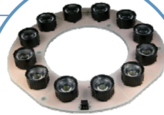
OPA741_ (23° Beam Angle)

The OPA741 Series are designed for areas where lighting intensity and reliability are essential. The light beam angle of 23° is ideal for illuminating areas close or a long distances from the device while requiring minimal space. A High Performance Heat Spreader (HPHS) is used to ensure the best heat dissipation of any light assembly in the industry.