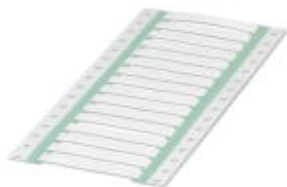
The illustration shows WMS 6,4 (30X10)R

Shrink sleeve, Roll, white, Unlabeled, Can be labeled with: THERMOMARK ROLL, THERMOMARK X, THERMOMARK S1.1, Perforated, Mounting type: Slide on, Cable diameter: 0.8-2.4 mm, Lettering field: 30 x 4 mm