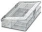
Assortment box, 12 compartments external dimensions 335 x 225 x 55 mm, material: Polystyrene