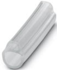
Conductor marker carrier, transparent, unlabeled, Mounting type: slide on, Cable diameter: 0.6-1.2 mm, Lettering field: 4 x 12 mm

Please be informed that the data shown in this PDF Document is generated from our Online Catalog. Please find the complete data in the user's documentation. Our General Terms of Use for Downloads are valid ( http://phoenixcontact.com/download )