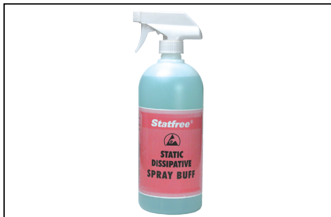
Figure 1. Statfree® Dissipative Spray Buff, ready-to-use 1 quart spray bottle