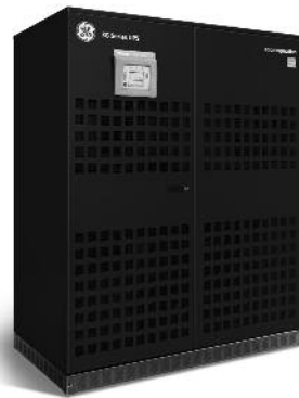
225-300 kVA Three-Phase