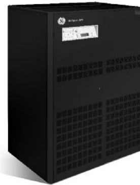
10-150 kVA Three-Phase

The GE UPS systems are designed with serviceability in mind. Any factory trained service provider can utilize GE's open architecture to perform diagnostics and maintenance without requiring any proprietary software or special interface equipment. The systems are fully supported by GE's Global Services team, which is renowned for its world-class, 24 x 7 preventive and corrective services, training, and application expertise.