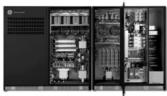
400-750 kVA Three-Phase