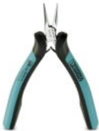
Electronic needle-nose pliers, smooth grip, with opening spring

Please be informed that the data shown in this PDF Document is generated from our Online Catalog. Please find the complete data in the user's documentation. Our General Terms of Use for Downloads are valid ( http://phoenixcontact.com/download )