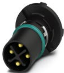
Flush-type connector, Universal, 4-position, PlugLink:straight, S power, PCB mounting, THR solder connection

Please be informed that the data shown in this PDF Document is generated from our Online Catalog. Please find the complete data in the user's documentation. Our General Terms of Use for Downloads are valid ( http://phoenixcontact.com/download )