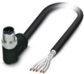
Sensor/Actuator cable, 5-position, RADOX® GKW S halogen-free, black, shielded, Plug angled M12 SPEEDCON, A-coded, on free cable end, Cable length: 2 m, For railway applications

Please be informed that the data shown in this PDF Document is generated from our Online Catalog. Please find the complete data in the user's documentation. Our General Terms of Use for Downloads are valid ( http://phoenixcontact.com/download )