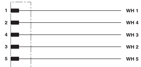
Contact assignment of the M12 plug