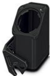
HEAVYCON EVO coupling housing, plastic, with bayonet flange for EVO screw connection, B10, with single locking latch, height: 90 mm, without EVO screw connection

Please be informed that the data shown in this PDF Document is generated from our Online Catalog. Please find the complete data in the user's documentation. Our General Terms of Use for Downloads are valid ( http://phoenixcontact.com/download )