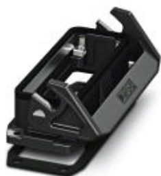
HEAVYCON EVO panel mounting base, plastic, B24, with single locking latch, height: 30.5 mm, with flat gasket

Please be informed that the data shown in this PDF Document is generated from our Online Catalog. Please find the complete data in the user's documentation. Our General Terms of Use for Downloads are valid ( http://phoenixcontact.com/download )