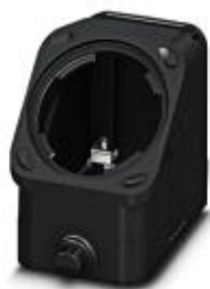
HEAVYCON EVO sleeve housing, plastic, with bayonet flange for EVO screw connection, B10, for single locking latch, height: 60.5 mm, without EVO screw connection

Please be informed that the data shown in this PDF Document is generated from our Online Catalog. Please find the complete data in the user's documentation. Our General Terms of Use for Downloads are valid ( http://phoenixcontact.com/download )