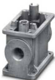
HEAVYCON ADVANCE B6 coupling housing, for M6 screw locking, salt-water-resistant aluminum, with 1 x M25 thread, straight cable outlet, without surface coating

Please be informed that the data shown in this PDF Document is generated from our Online Catalog. Please find the complete data in the user's documentation. Our General Terms of Use for Downloads are valid ( http://phoenixcontact.com/download )