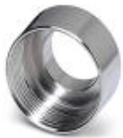
Step-up adapter, M20 to M25, including O-ring

Extension adapter - ENLAR-M-KV-M20/M25 - 1647666