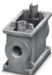
HEAVYCON ADVANCE B10 coupling housing, for M6 screw locking, salt-water-resistant aluminum, with 1 x M20 thread, straight cable outlet, without surface coating

Please be informed that the data shown in this PDF Document is generated from our Online Catalog. Please find the complete data in the user's documentation. Our General Terms of Use for Downloads are valid ( http://phoenixcontact.com/download )