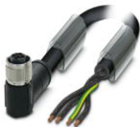
Power cable, 4-position, PUR halogen-free, black-gray RAL 7021, free cable end, on Socket angled M12 SPEEDCON, S-coded, Cable length: 10 m, For AC current up to 12 A/630 V

Please be informed that the data shown in this PDF Document is generated from our Online Catalog. Please find the complete data in the user's documentation. Our General Terms of Use for Downloads are valid ( http://phoenixcontact.com/download )