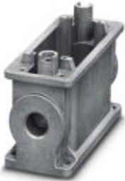
HEAVYCON ADVANCE B16 basic housing without screw openings, for M6 screw locking, salt-water-resistant aluminum, without surface coating

Please be informed that the data shown in this PDF Document is generated from our Online Catalog. Please find the complete data in the user's documentation. Our General Terms of Use for Downloads are valid ( http://phoenixcontact.com/download )