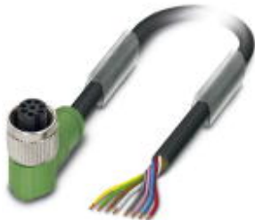
M12 socket, angled, 8-pos., with connected master cable, for sensor/actuator box with M8 slots, cable length: 5 m

Please be informed that the data shown in this PDF Document is generated from our Online Catalog. Please find the complete data in the user's documentation. Our General Terms of Use for Downloads are valid ( http://phoenixcontact.com/download )