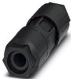
QUICKON cable connector, black, 4+PE-pos., 2.5 mm 2 ... 6.0 mm 2 /690 V/40 A, for cable diameter of 12 mm ... 20 mm.

Please be informed that the data shown in this PDF Document is generated from our Online Catalog. Please find the complete data in the user's documentation. Our General Terms of Use for Downloads are valid ( http://phoenixcontact.com/download )