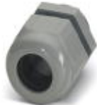
Cable gland, Cable gland material: Polyamide 6, External cable diameter 11 mm ... 17 mm, Shielding: No, Connecting thread: M25, Color: silver grey

Cable gland - G-INS-M25-M68N-PNES-GY - 1411126