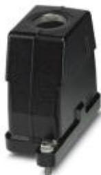
HEAVYCON B6 sleeve housing, HPR series, with screw locking, with M32 thread, straight outlet, for increased environmental and EMC requirements

Please be informed that the data shown in this PDF Document is generated from our Online Catalog. Please find the complete data in the user's documentation. Our General Terms of Use for Downloads are valid ( http://phoenixcontact.com/download )