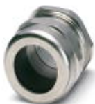
Metal screw connection up to 5 bar, thread length: 7 mm, cable diameter: 14 - 21 mm, WAF 34, screw connection: M25

Cable gland - HC-M-KV-M25(14-21) - 1646007