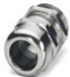
Cable gland, Cable gland material: Brass, nickel-plated, External cable diameter 11 mm ... 17 mm, Shielding: No, Connecting thread: M25, Color: silver

Cable gland - G-INS-M25-M68N-NNES-S - 1411165