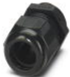
Cable gland, Cable gland material: Polyamide 6, External cable diameter 11 mm ... 17 mm, Shielding: No, Connecting thread: M25, Color: jet black

Cable gland - G-INS-M25-M68N-PNES-BK - 1411134