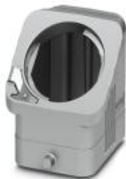
HEAVYCON EVO sleeve housing, EMC version, without powder coating, with bayonet flange for EVO screw connection, B6, for single locking latch, height: 64 mm, without EVO screw connection.

Please be informed that the data shown in this PDF Document is generated from our Online Catalog. Please find the complete data in the user's documentation. Our General Terms of Use for Downloads are valid ( http://phoenixcontact.com/download )