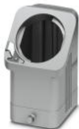
HEAVYCON EVO sleeve housing, EMC version, without powder coating, with bayonet flange for EVO screw connection, B6, for single locking latch, height: 80 mm, without EVO screw connection.

Please be informed that the data shown in this PDF Document is generated from our Online Catalog. Please find the complete data in the user's documentation. Our General Terms of Use for Downloads are valid ( http://phoenixcontact.com/download )