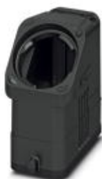
HEAVYCON EVO sleeve housing, plastic, with bayonet flange for EVO screw connection, D15 series, for single locking latch, height: 65.5 mm, without EVO screw connection

Please be informed that the data shown in this PDF Document is generated from our Online Catalog. Please find the complete data in the user's documentation. Our General Terms of Use for Downloads are valid ( http://phoenixcontact.com/download )