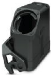
HEAVYCON EVO coupling housing, plastic, with bayonet flange for EVO screw connection, D25, with single locking latch, without EVO screw connection

Please be informed that the data shown in this PDF Document is generated from our Online Catalog. Please find the complete data in the user's documentation. Our General Terms of Use for Downloads are valid ( http://phoenixcontact.com/download )