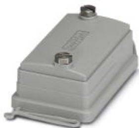
HEAVYCON ADVANCE, IP66, B10 protective cover for panel mounting side, with screw locking, with retaining cord, diameter of retaining cord eyelet: 3 mm

Please be informed that the data shown in this PDF Document is generated from our Online Catalog. Please find the complete data in the user's documentation. Our General Terms of Use for Downloads are valid ( http://phoenixcontact.com/download )