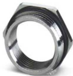
Reducing adapter, Nickel-plated brass, Connecting thread: Pg16

Please be informed that the data shown in this PDF Document is generated from our Online Catalog. Please find the complete data in the user's documentation. Our General Terms of Use for Downloads are valid ( http://phoenixcontact.com/download )