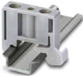
End clamp width: 6 mm, color: gray

Please be informed that the data shown in this PDF Document is generated from our Online Catalog. Please find the complete data in the user's documentation. Our General Terms of Use for Downloads are valid ( http://phoenixcontact.com/download )