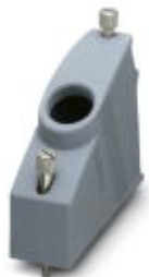
Sleeve housing, plastic, with metric cable outlet, locking screws with knurled head, type: VC4, cable screw connection: M25

Please be informed that the data shown in this PDF Document is generated from our Online Catalog. Please find the complete data in the user's documentation. Our General Terms of Use for Downloads are valid ( http://phoenixcontact.com/download )