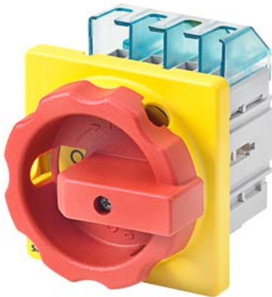
EMERG. STOP SWITCH 4-POLE IU=16, P/AC-23A AT 400V=7.5KW FRONT MOUNTING FOUR- HOLE MOUNTING ROTARY ACTUATOR RED/YELLOW (EMERG. STOP)