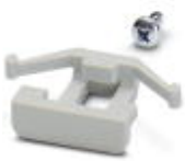
Panel mounting base, Base latch, color: gray

Mounting material - UM-ALU 4 FOOT - 2200974