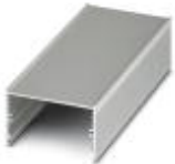
Panel mounting base, Upper part, color: aluminum color, width: 75 mm, length: 165 mm, height: 43.1 mm

Components of electronic housing - UM-ALU 4 AU75 L165 - 2200967