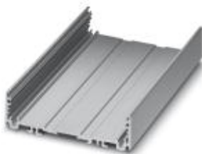
Panel mounting base, Lower part, color: aluminum color, width: 105 mm, length: 165 mm, height: 29.4 mm

Please be informed that the data shown in this PDF Document is generated from our Online Catalog. Please find the complete data in the user's documentation. Our General Terms of Use for Downloads are valid ( http://phoenixcontact.com/download )