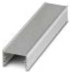
Panel mounting base, Upper part, color: aluminum color, width: 45 mm, length: 165 mm, height: 28.1 mm

Components of electronic housing - UM-ALU 4 AU45 L165 - 2200958