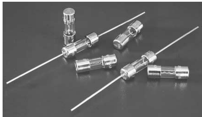
225 000 Series

Contact Littelfuse concerning other ampere ratings.