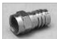
Crimp-On F-56 (M) for Teflon/Plenum RG-6 Cable.