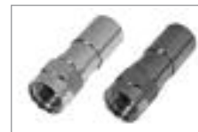
'F' Compression (M) Crimp, 1 Piece for Weatherproof Applications (use crimp tool 24-77144P).