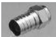
Crimp-On F-56ALM (M) for RG-6 Cable.