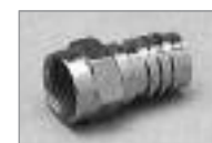
Crimp-On F-56ALM (M) for RG-6 Cable, Zinc Plated.