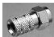
Twist-On F-56 (M) for standard RG-6 Cable.