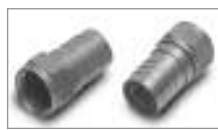
F-56ALM WP (M) Crimp, 1 Piece, 0.324 Diameter, Chromate Plated, with Interior Gasket.