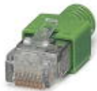
The figure shows the version FL PLUG RJ45 GN/2

RJ45 connector, shielded, with bend protection sleeve, 2 pieces, gray for straight cables, for assembly on site. For connections that are not crossed, it is recommended that you use the connector set with gray bend protection sleeve.