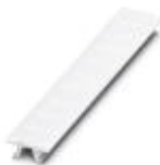
Zack marker strip, Strip, white, unlabeled, can be labeled with: Plotter, Mounting type: Snap into tall marker groove, for terminal block width: 6.2 mm, Lettering field: 6.15 x 10.5 mm

Zack marker strip - ZB 6/WH-100:UNBEDRUCKT - 5060935