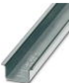
DIN rail, unperforated, Standard profile, width: 35 mm, height: 15 mm, similar to EN 60715: 2001, material: Steel, Galvanized, white passivated, length: 2000 mm, color: white

DIN rail, unperforated - NS 35/15 WH UNPERF 2000MM - 1204135