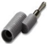
Reducing plug, color: gray