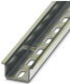
DIN rail perforated, Standard profile, width: 35 mm, height: 15 mm, similar to EN 60715: 2001, material: Steel, galvanized, passivated with a thick layer, length: 2000 mm, color: silver

DIN rail perforated - NS 35/15 PERF 2000MM - 1201730