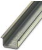
DIN rail, unperforated, Standard profile, width: 35 mm, height: 15 mm, similar to EN 60715: 2001, material: Steel, galvanized, passivated with a thick layer, length: 2000 mm, color: silver

DIN rail, unperforated - NS 35/15 UNPERF 2000MM - 1201714