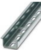
DIN rail perforated, Standard profile, width: 35 mm, height: 15 mm, similar to EN 60715: 2001, material: Steel, Galvanized, white passivated, length: 2000 mm, color: white

DIN rail perforated - NS 35/15 WH PERF 2000MM - 0806602