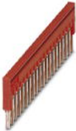
Plug-in bridge, pitch: 3.5 mm, number of positions: 20, color: red

Please be informed that the data shown in this PDF Document is generated from our Online Catalog. Please find the complete data in the user's documentation. Our General Terms of Use for Downloads are valid ( http://phoenixcontact.com/download )