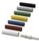
Insulating sleeve, Color: green