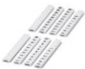
Zack Marker strip, flat, can be ordered: Strip, white, labeled according to customer specifications, Mounting type: Snap into flat marker groove, for terminal block width: 3.5 mm, Lettering field: 3.5 x 5.2 mm

Zack Marker strip, flat - ZBF 3,5 CUS - 0829394