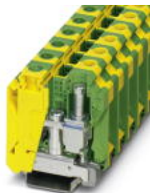
Ground modular terminal block, with screwfix, Connection method: Screw connection, Cross section: 1.5 mm² - 35 mm², AWG: 16 - 2, Width: 16 mm, Color: green-yellow, Mounting type: NS 35/7,5, NS 35/15

Please be informed that the data shown in this PDF Document is generated from our Online Catalog. Please find the complete data in the user's documentation. Our General Terms of Use for Downloads are valid ( http://phoenixcontact.com/download )