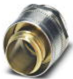
Cable gland made from brass with metric thread, rotatable, IP40 protection

Screw connection - WP-GT BRASS M16 - 3241032