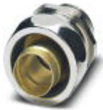
Cable gland made from brass with Pg thread, IP40 protection

Screw connection - WP-G BRASS IP40 PG11 - 3241039