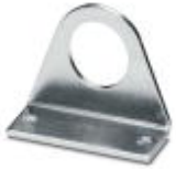
Fixing bracket for protective sleeves, fixed with two screws

Protective hose fixing bracket - WP-BASE A M16 - 3241083