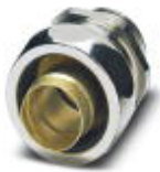
Cable gland made from brass with metric thread, IP40 protection

Screw connection - WP-G BRASS IP40 M16 - 3241046