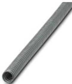
Galvanized steel protective hose, 1 Pcs. / Pkt. = roll à 10 m

Please be informed that the data shown in this PDF Document is generated from our Online Catalog. Please find the complete data in the user's documentation. Our General Terms of Use for Downloads are valid ( http://phoenixcontact.com/download )