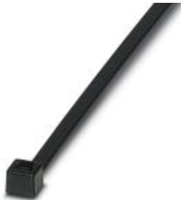
Cable binders for quick and secure bundling, standard version

Please be informed that the data shown in this PDF Document is generated from our Online Catalog. Please find the complete data in the user's documentation. Our General Terms of Use for Downloads are valid ( http://phoenixcontact.com/download )